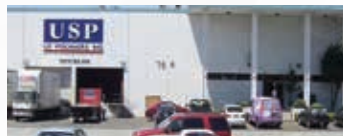
USP Corporate Headquarters Montebello, California