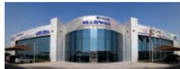
USP Harwal Group Headquarters Dubai Industrial Park, UAE